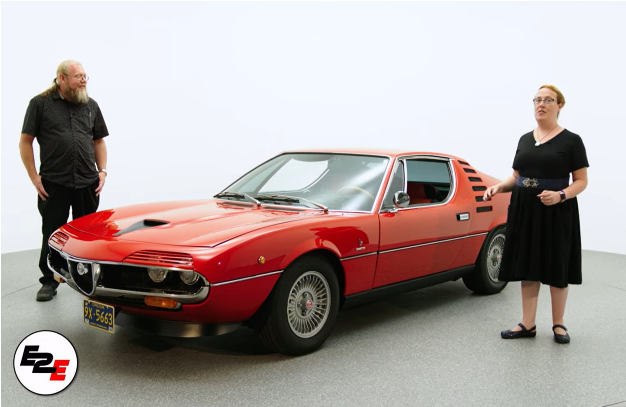
“Everyday 2 Exotic” - Episode 1 - Alex and Amy talk about, drive and enjoy their 1971 Montreal - click for more!